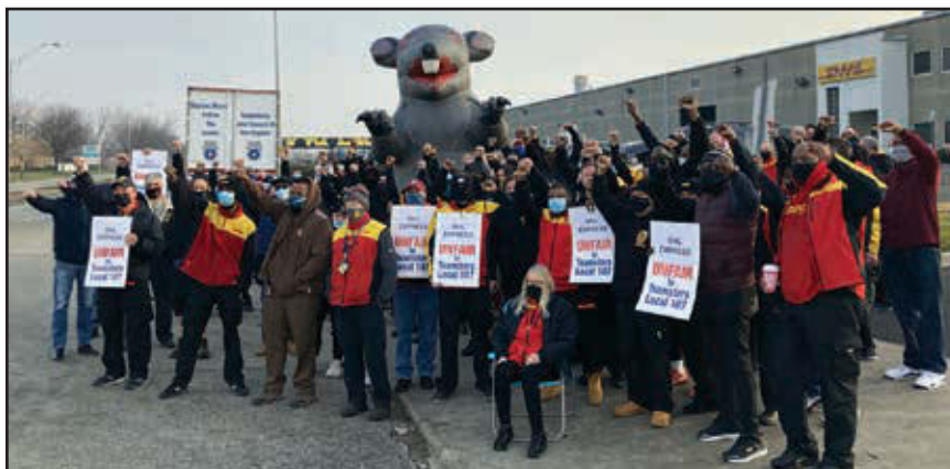
The Teamster "Rat" was on hand to stand in solidarity with Teamster Members at DHL