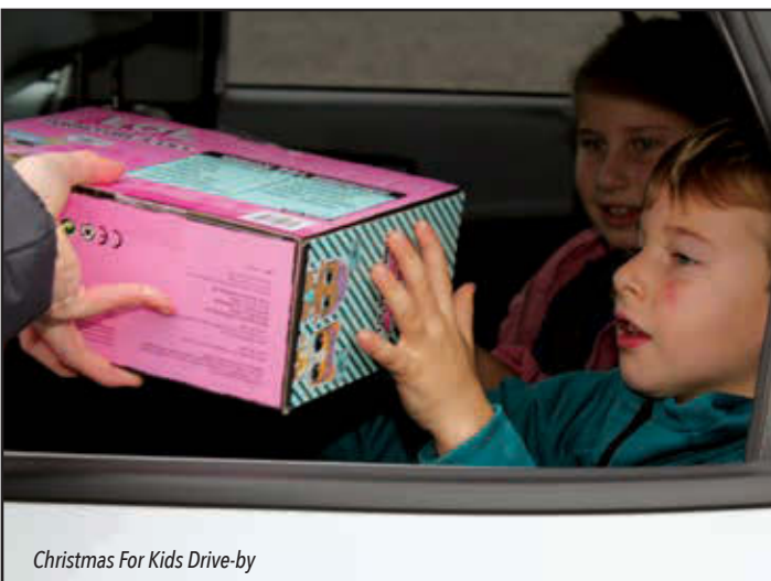
Christmas For Kids Drive-by

We were able to help some of the neediest families in the York area have a brighter holiday!