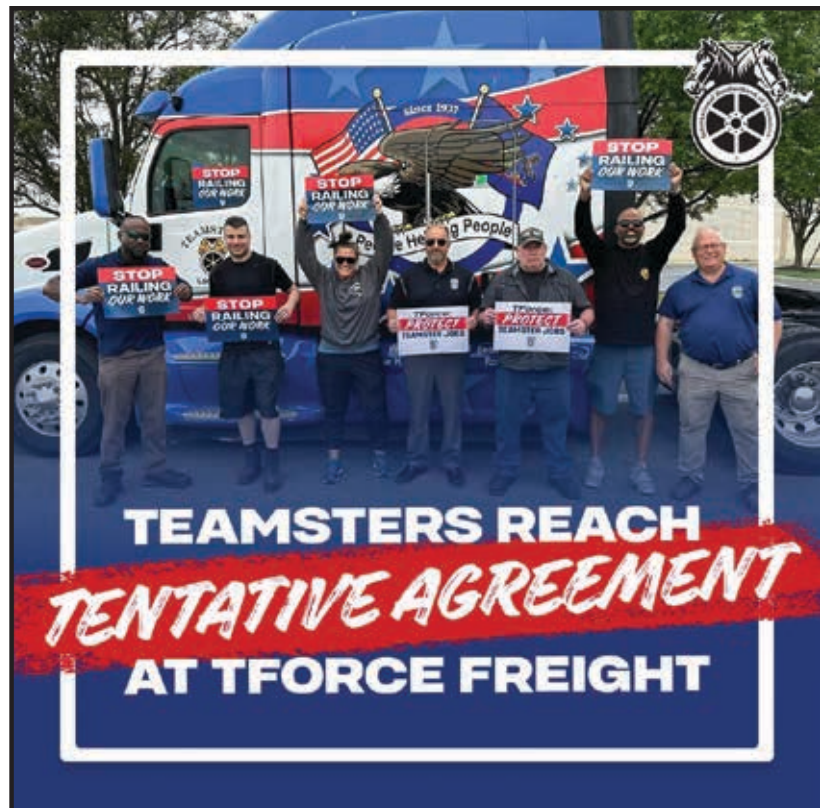
Local 776 TForce Members are Teamster Strong!

The Teamsters represent approximately 7,800 local cartage drivers, road drivers, and clerical workers with TForce Freight at 126 local unions nationwide. The current five-year agreement expires July 31.