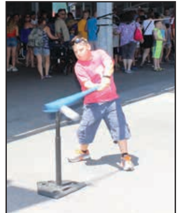
There's plenty to do at the kids "Fun Zone" below the stadium

Bring your family, your friends, your co-workers and enjoy a night of baseball while supporting the Local 776 Scholarship fund. When purchasing your tickets you will have the option to have your name displayed with your seats so others can see where you are located, making it easier to sit together. Tickets go fast for Senators games; don't delay, get yours today and we'll see you at the ballpark!