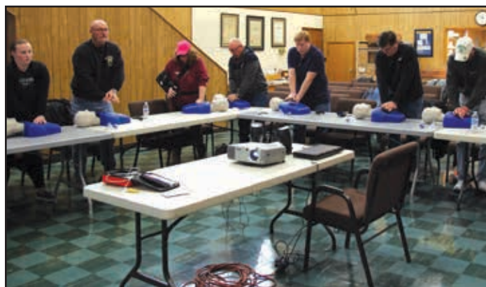
Members received "Hands on" Training as part of the class

Recognizing the need for members to be prepared in the event of a life threatening situation, Local 776 conducted three life-saving skills training seminars on March 9, 2019.