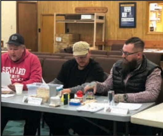
Class time stressed the proper procedures to follow on the dock...

Recognizing the importance of work place safety Teamsters Local 776 hosted the IBT/ABF American Apprenticeship Initiative Train-the-Trainer Program during the week of March 11th thru the 15th, 2019. The program was a collective effort between the IBT, Local 776 and ABF.