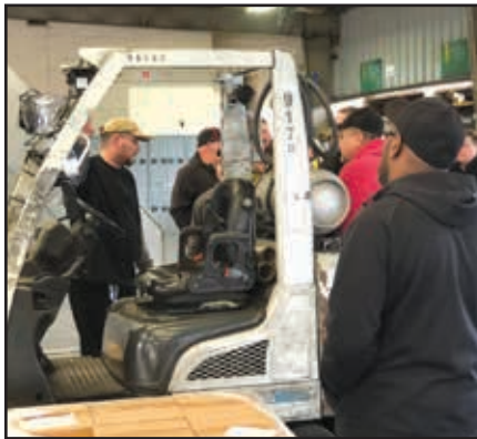
Followed by hands on experience on the dock.