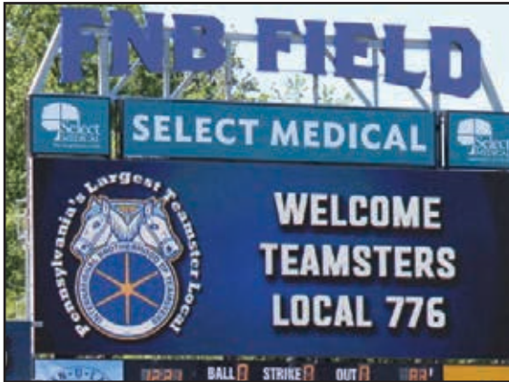
Welcome Teamster Baseball Fans!

In collaboration with Harrisburg Senators Baseball