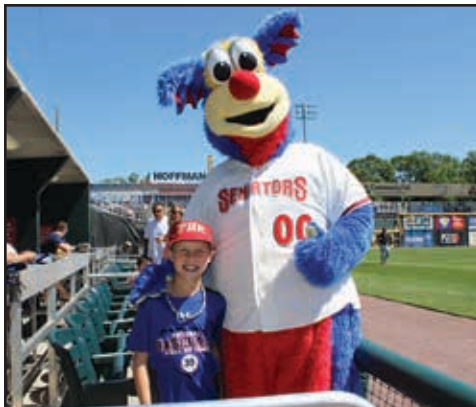
The Senators Mascot "Rascal" is always a hit with the kids!!!