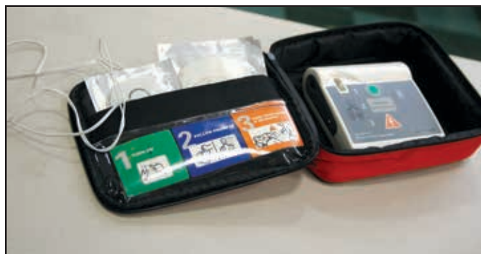
Participants had an actual defibrillator to become familiar with while being trained in its proper use.

With training provided by One Heartbeat Away, LLC all of the participants now have the skills to assist and intervene when confronted with an emergency situation. The members were trained and certified in CPR (Cardio Pulmonary Resuscitation), AED (Automatic External Defibrillator) and choking emergencies.