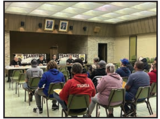
The speakers had the attention of the Members in Harrisburg (L) and York.