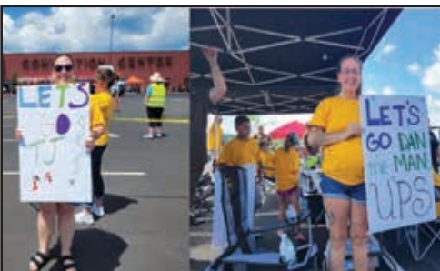
Family members cheer on their favorite driver!

To view additional photos from the Truck Driving Championship, please visit the "Photo Gallery".