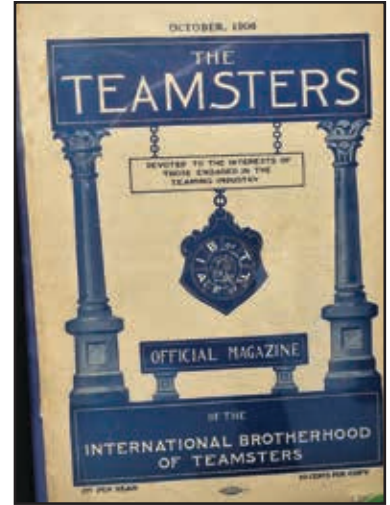
An early Teamsters Magazine extensive collection.