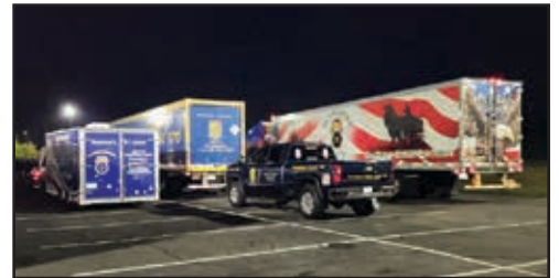
Local 776's truck gets in line for the trip to the Boston strike line

Sean M. O'Brien said. "Any company that bullies workers will be met with the full firepower of this union. Our momentum cannot be stopped. We still have open contracts around the country, and we will strike again and again to protect our members."