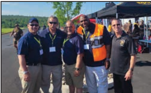
TForce Freight Members