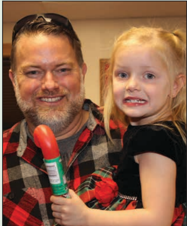
Local 776 Children's Christmas Party: The Local's Party for Members and Retirees Kids and Grandkids is always popular!