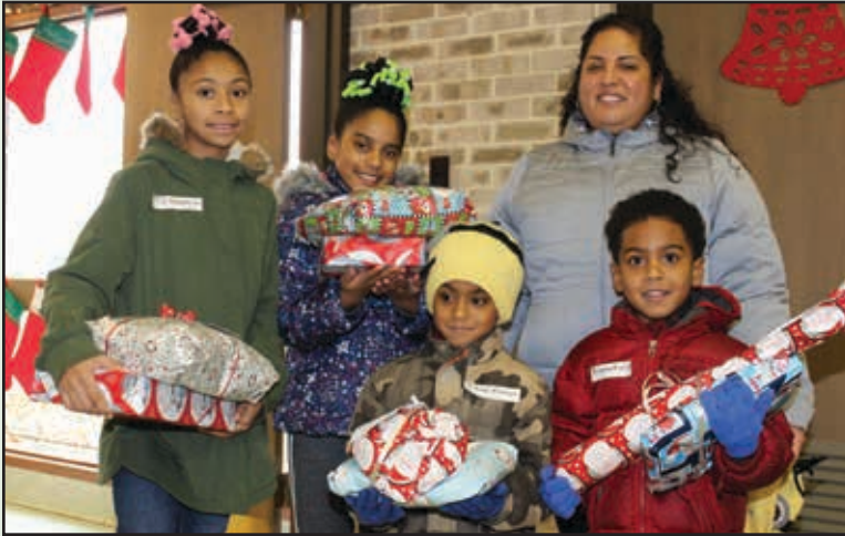
York Christmas For Kids Party: The Local's Community Services Project helps some of the neediest families in the York Area have a brighter Christmas.

What better way to celebrate the Holidays than by sharing. We share with our Brothers and Sisters in the labor community. We lend a hand to aid other's charitable works. We bring assistance to many in the communities where we live and work who are less fortunate so they and their kids do not go without. As a service organization, the Local realizes and tries to fulfill its responsibility to our members in the workplace as well as a responsibility to the members of our community throughout the year.