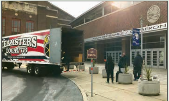
Holiday Helping Hand: The Local Union helped Dauphin County Human Services move to the Farm Show for their Annual Holiday Celebration for needy families.