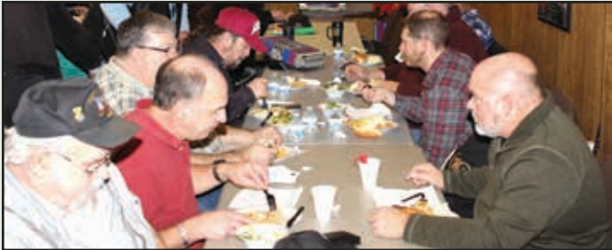
Monthly Membership Meeting Dinner: At the conclusion of the December membership meeting the members in attendance were treated to a Christmas Dinner.