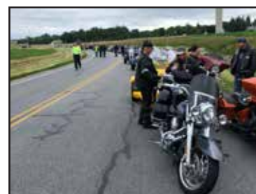
A long line forms up for a recent horsemen ride

for Paws, which provides safety gear for police canines, Operation God Bless America to support military veterans, and Sacrifice and Service to support homeless veterans and deployed troops. We have also donated money to sponsor a golf tournament for a local girl with SDS.