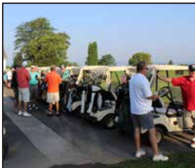
776 members prepare for the starting word

Local 776 held their annual members golf tournament on Sunday August 5, 2018. Sunny skies and temperatures as hot as the friendly competition greeted the players as they teed it up for Local 776 bragging rights. When the last put dropped and the scores tallied up the members were treated to a steak dinner as they discussed what shot could a, should a, would a, gone farther, straighter, or in the cup sooner. In addition to door prizes awards were issued in the following categories: