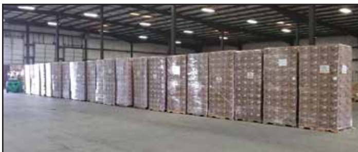
UTZ Foods donated enough product to create two full trailer loads for Rich to transport

Hurricane Florence pummeled North Carolina with record rainfall amounts, and consequently record flooding in September 2018. Major highways were shut down as the floodwaters surpassed previous record highs levels. Utz Foods of Hanover, PA stepped up, donating two trailer loads of non-perishable products through the Red Cross. The Red Cross