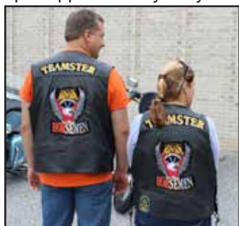
Proud to be Teamster Horsemen (and women!)