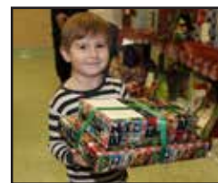
This guy has his hands full!

cember 1st from 11:00 AM until 1:00 PM at the York Union Hall. The day of the party the Hall is decorated for Christmas, Santa arrives with all of the brightly