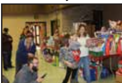
Kids, Gifts, smiling faces it must be Christmas

The process begins with the WIC program handing out papers to the parent/guardian, they then have to call the Local Union and register the children for the party along with what the child would like for Christmas. If it wasn't for the party many of these kids might not have a Christmas. Many ask for a toy or a game but