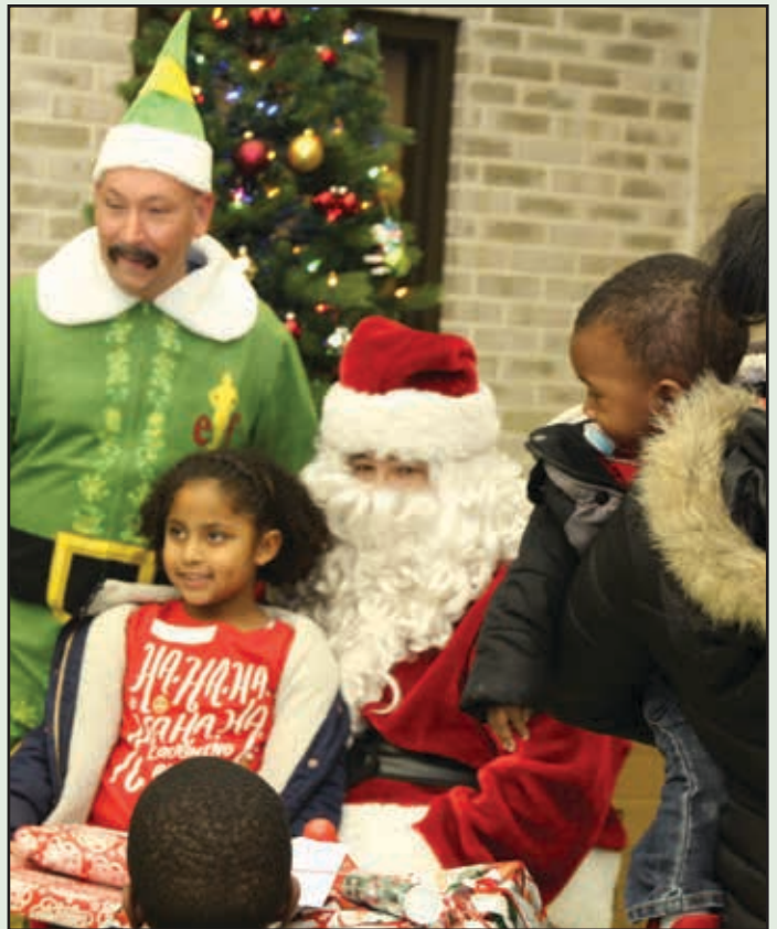
York Christmas For Kids Party: The Local's Community Services Project helps some of the neediest families in the York Area have a brighter Christmas.