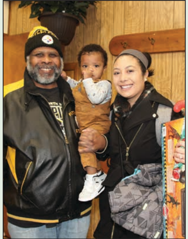
Local 776 Children's Christmas Party: The Local's Party for Members and Retirees Kids and Grandkids brings out smiles