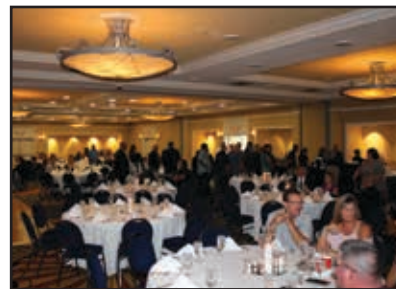
A good crowd of Steward's and guests were on hand