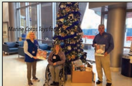
Marine Corps Toys for Tots