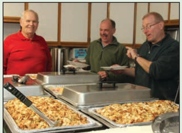
Monthly Membership Meeting Dinner: At the conclusion of the December membership meeting the members in attendance were treated to a Christmas Dinner