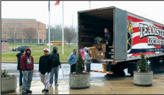
Holiday Helping Hand: The Local Union helped Dauphin County Human Services move to the Farm Show for their Annual Holiday Celebration for needy families.