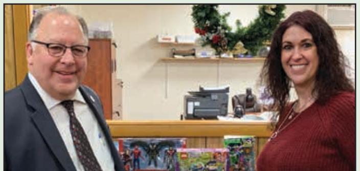
Christmas Gift Donations: At the conclusion of the Holiday Parties the Local had remaining gifts that were donated to: Access York, HMC Children's Hospital, Marine Corps Toys for Tots, Shriners Hospital, and York County K9 Assoc. Christmas for Kids