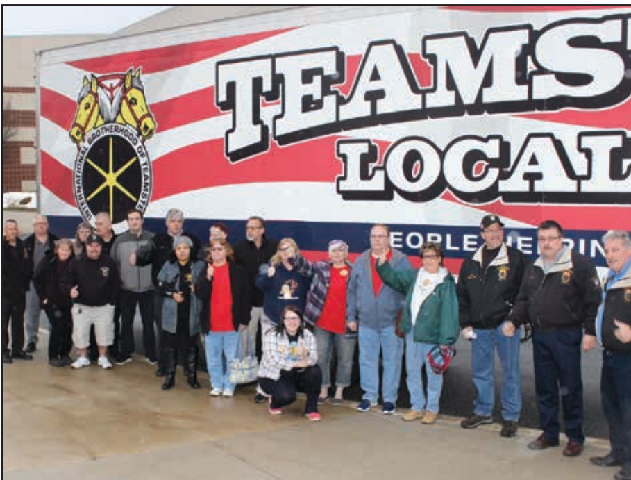
It's thumbs up for a new Pleasant Acres Contract!

During negotiations the employer agreed to honor all members' seniority earned with York County, and also honor the established pay rates negotiated with the County. Along with classification percentage raises, a one time ratification signing bonus of $500 for full-time employees, and $250 for part-time employees was negotiated. In voting that took place on October 1, 2019 the tentative agreement was approved by more than 90% of the membership that participated in the vote. The new agreement runs from October 1, 2019 through September 30, 2023.