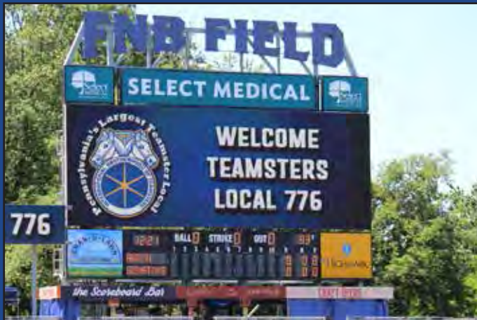
The Senators welcomed Local 776 members and families.