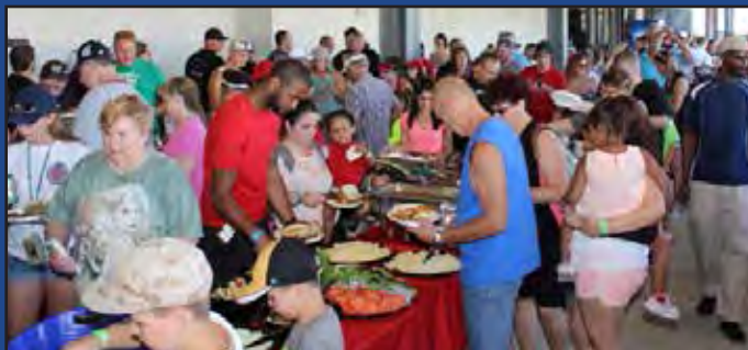
Good food, good friends and good times was the recipe for the annual Local 776 Picnic and Baseball game.

June 12 was a great day for a picnic and a ball game.