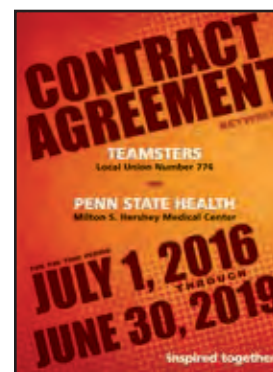
The new Hershey Medical Center Contract was printed by Local 776 members at HMC.