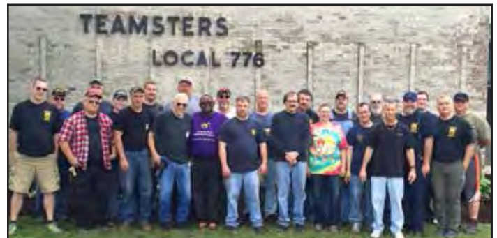
Teamster Can-Do spirit accomplished the restoration of the York Hall done on time and under budget.

Members can view a short video of the York Hall restoration at: https://www.youtube.com/watch?