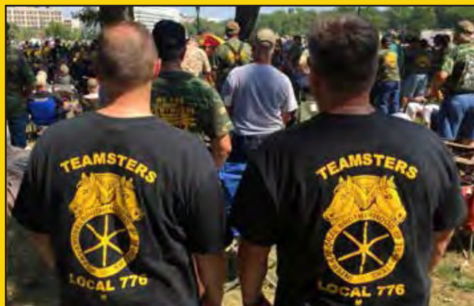
Local 776 members stood in support of Keeping the Promise at a Mine Worker's rally on Capitol Hill in Washington.

In September, Local 776 sent a delegation to support the United Mine Workers of America's (UMWA) "Keep the Promise" rally in Washington DC.