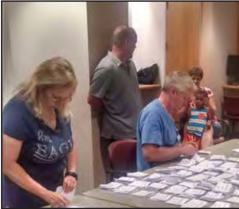
Local 776 members counted the Ratification vote ballots cast in July

of the proposals with the attending members and asked if there were any additional proposals or issues that needed to be addressed.