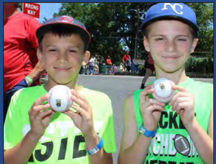
Future Teamsters with a souvenir Local 776 emblazoned baseball offered to all the kids.