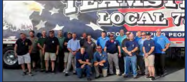
Local 776 members, Officers and Agents gathered at the Local 776 truck before the Newville Borough Council meeting.