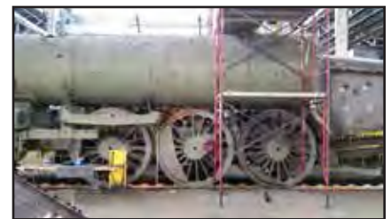
This old steam locomotive needed Local 776's help to get restored to former glory.