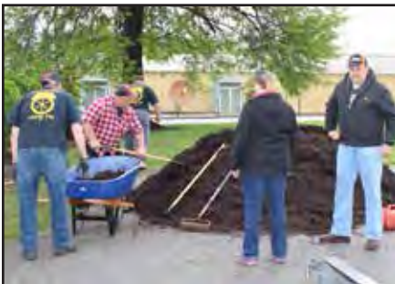
Members, Stewards, Agents, Officers and families all pitched in to clean up the exterior of the newly re-opened Local 776 York Union Hall.

Even prior to the "official" re-opening of the Hall in October 2016, Business Agents began working out of the restored Hall. Both Stewards' meetings and a regular monthly Local 776 Membership meeting have been held at the Hall. It's now easier and faster for members to meet with their Agents and representatives. More good things are on the way.