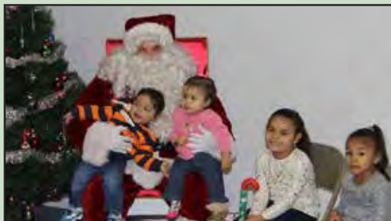
Santa is mobbed by appreciative kids at the Local 776 Christmas for Kids party in York

A special thanks to Stroehmann/Maier's Bakery and the Canteen Food Corporation for their generosity in helping us fill