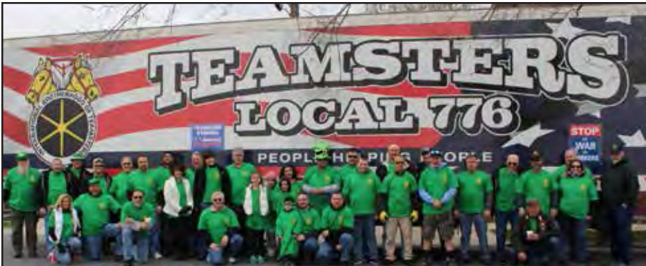
Local 776 Officers, Agents and members gather at the Local 776 tractor and trailer prior to the 2016 St. Patrick's Day Parade in Harrisburg.

Green, green, green. Agents and Officers in green and gold. Kids in green. Even dogs were in green. Trucks and trailers adorned in green and with Irish flags. And, green were the beads Local 776 distributed to parade watchers.