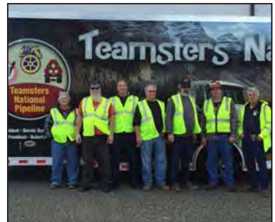
Local 776 contacted the Teamsters Pipeline Training Fund and scheduled a Forklift training day in January for our construction members to help them obtain their Forklift Certification.