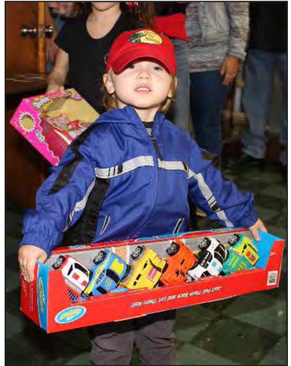
Clearly this little one is going to be a Teamster Driver some day – 6 cars in a box bigger than he is.