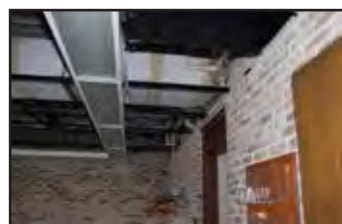
BEFORE: A typical scene at the York Local 776 Union Hall before the current administration undertook a renovation of the building due to total neglect of the physical plant by the prior administration.

On budget. On schedule. And, about time.