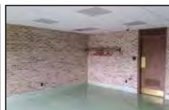
AFTER: The same York Union Hall location after replacing the building roof and replacing ruined ducts, lights, ceiling panels and wall.