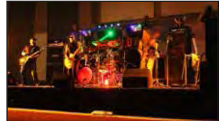
All work and no play .... The saying goes. The Hershey Lodge banquet featured dinner, dancing and door prizes for our Stewards and their spouses.

There really is no adequate way to thank the Stewards for all they do. The Local 776 Steward's Banquet is but a small gesture to show our appreciation.