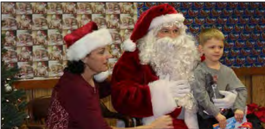
No one missed their opportunity to whisper into Santa's ear.

A hearty thanks to the Local 776 staff, Officers and Agents who made the term Brotherhood of Teamsters take on a special holiday meaning and ensuring another kid's Christmas Party success.