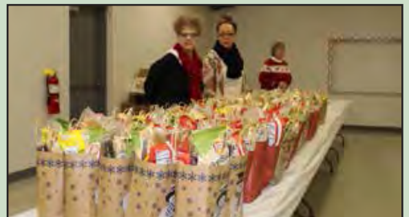
Stroehmann/Maier's and Canteen Food were generous in their donations for the Kid's party. Each child received a bag of goodies before they departed.

and provide a bag of treats for each kid to take home with them. Please think of both companies' generosity to the Teamster's community next time you have a snack or shopping need.